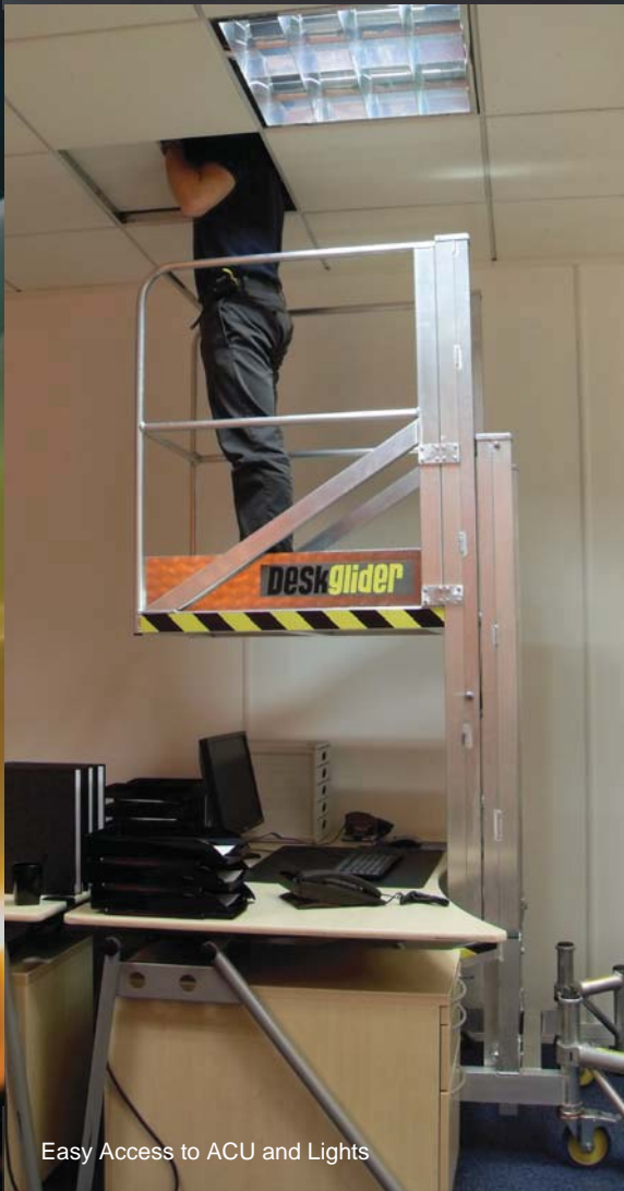
Easy Access to ACU and Lights