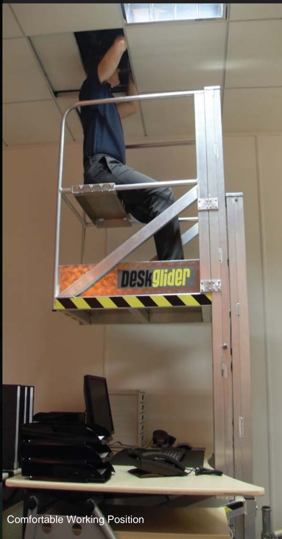
Comfortable Working Position