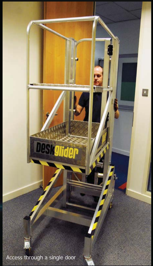
Access through a single door

Once in position, the Deskglider could not be simpler to use and to adjust to the required height.