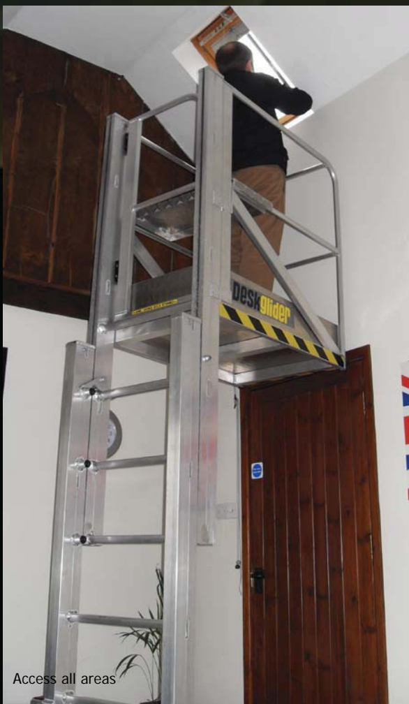
Access all areas

The Deskglider will prevent inconveniencing the user of the desk in many ways. The desk will not need to be cleared or computers, printers and telephones disconnected and the desk initially moved to do a simple job. In many cases above desk work has to be undertaken out of hours as to not disrupt a colleague or clients work, this means extra cost to someone. Cost aside the user of the desk may have to wait for sometime before normal working service is resumed, the same can apply with laboratory benches and school desks, now all this can be history with the Deskglider. The Deskglider need never be redundant, it can be purchased and used solely for use over desks but in fact it is more likely to replace the need for step ladders in any business or facility, a goal desired by nearly every work place.